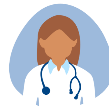
Speak to your GP

All of these people can help you find support. The National Gambling Helpline and your GP can help refer you to Gambling-based Counselling services or peer support groups that suit your needs.