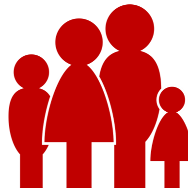
Speak to family or friends

ACKNOWLEDGING YOU HAVE A PROBLEM WITH GAMBLING IS THE BIGGEST STEP ON THE ROAD TO YOUR RECOVERY.