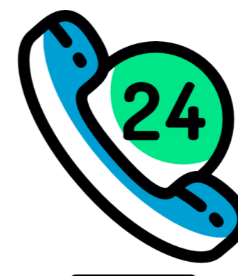
Contact National Gambling Helpline